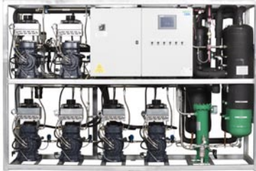
CRYSTAL DX 4.2